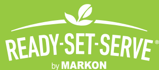
Table-ready fruits & vegetables. Backed by 5-Star.