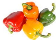
bell peppers green/red